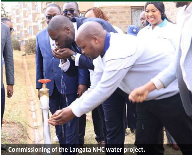
Commissioning of the Langata NHC water project.