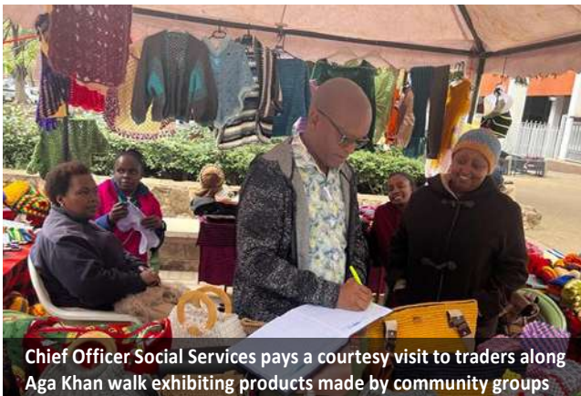
Chief Officer Social Services pays a courtesy visit to traders along Aga Khan walk exhibiting products made by community groups