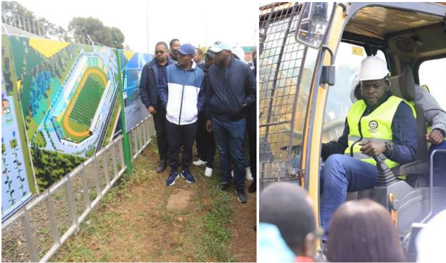
Groundbreaking of Joe kadenge Stadium

Nairobi, a city known for its vibrant culture and diverse population, is now placing a significant emphasis on the role of sports in its growth and development. The Governor of Nairobi, H.E Hon. Sakaja Arthur Johnson, has articulated the essential nature of sports as a sector deserving substantial funding. This strategic investment aims to nurture the burgeoning talents of the city's youth while also recognizing the economic potential inherent in the sports industry.