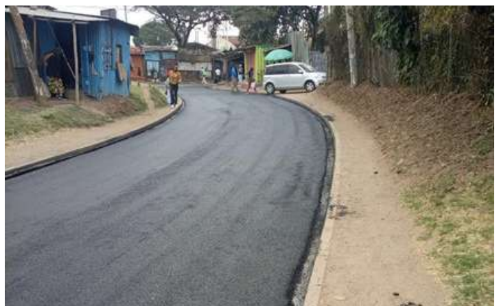
Rehabilitation of Muchai drive, Kenyatta market/ Woodley Ward. Nairobi City County Mobility & Works Sector. Funding source: RMLF.

A publication by the Nairobi City County Government