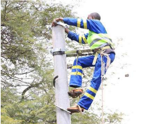
Installation of street lights on Kingara road.