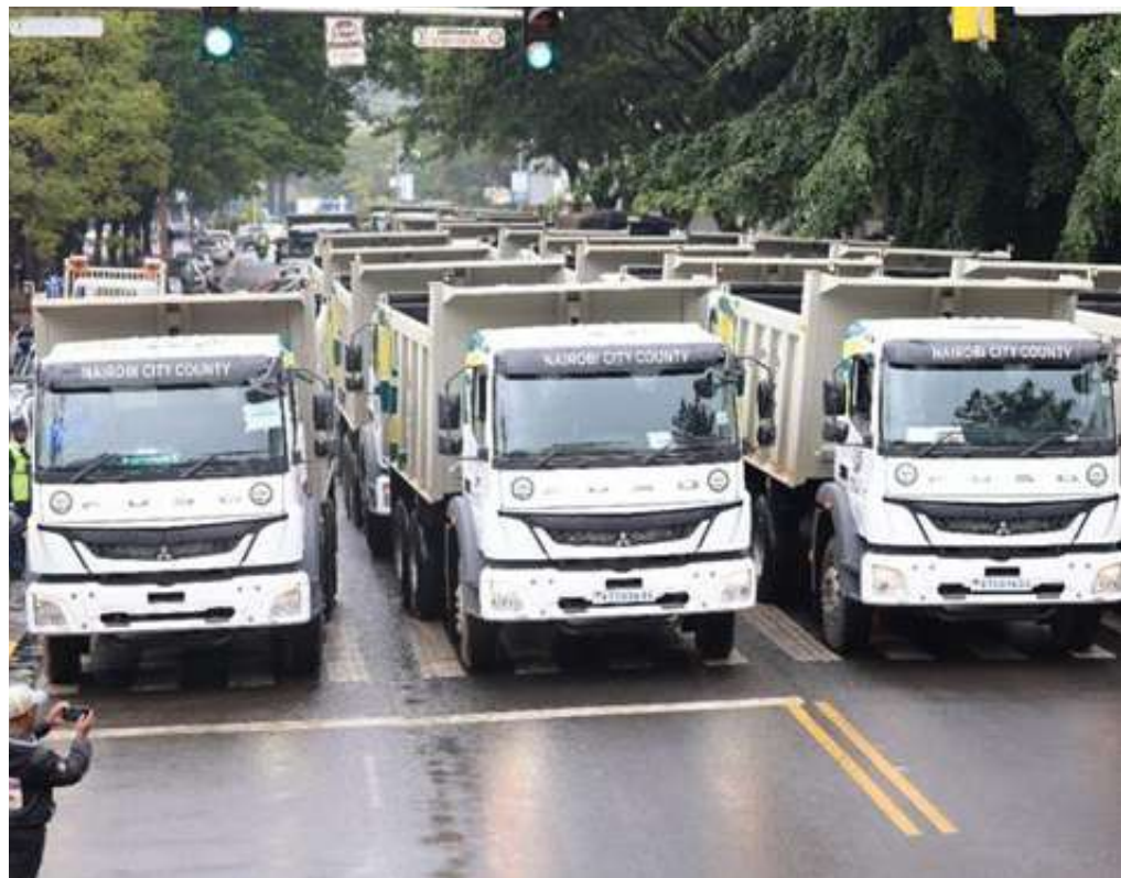
Fleet of 27 tippers which are part of 61 trucks and Refuse Compactors flagged off to help with the solid waste management efforts.