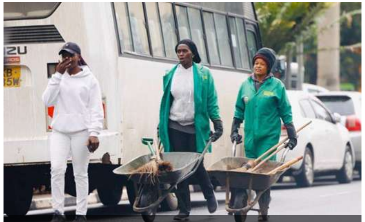
Environment teams cleaning up the CBD