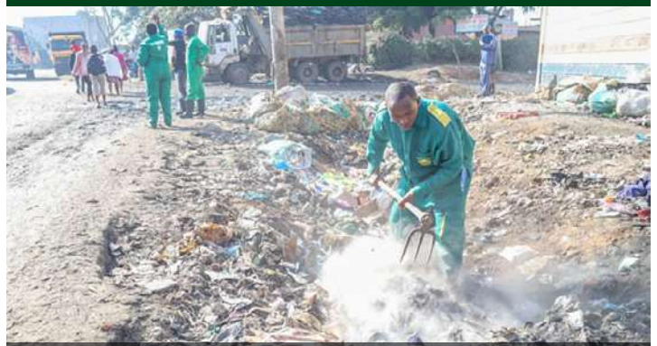
Clean up of Dandora 41 , street leveling.