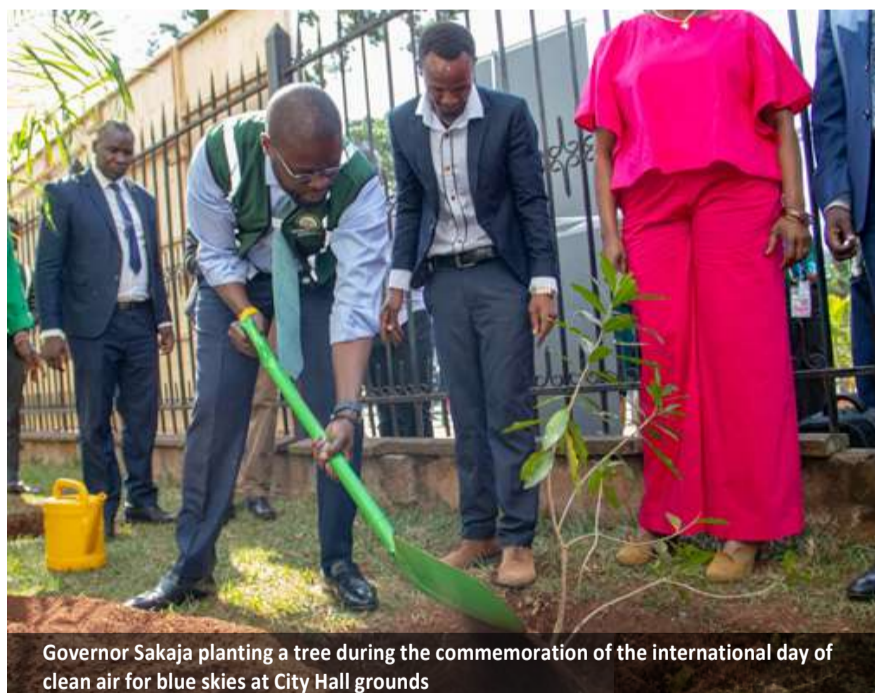
Governor Sakaja planting a tree during the commemoration of the international day of clean air for blue skies at City Hall grounds

A publication by the Nairobi City County Government