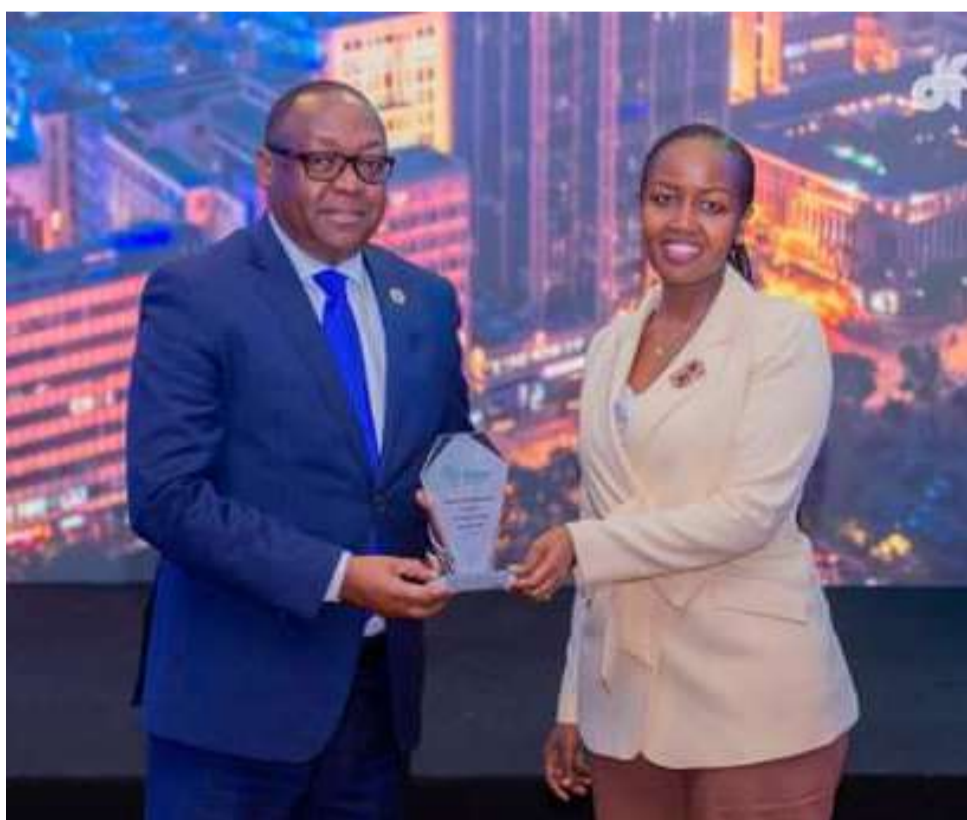
Deputy Governor receives an award on behalf of Nairobi City during the Smart City Investment summit held in Kigali, Rwanda. Nairobi City was placed 3rd in the Africa Smart City investment Summit index in Africa and 1st in the Economic Tech Catalyst Category in Africa. The summit held in the month of September brought together more than 1,000 participants across Africa and beyond.

The comprehensive disaster management plan put forth by the Nairobi County government reflects a dedication to safeguarding the well-being of its residents and minimizing the potential risks associated with adverse weather conditions.