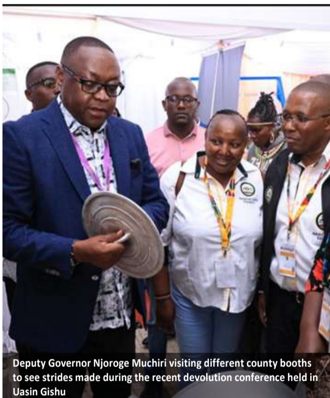
Deputy Governor Njoroge Muchiri visiting different county booths to see strides made during the recent devolution conference held in Uasin Gishu