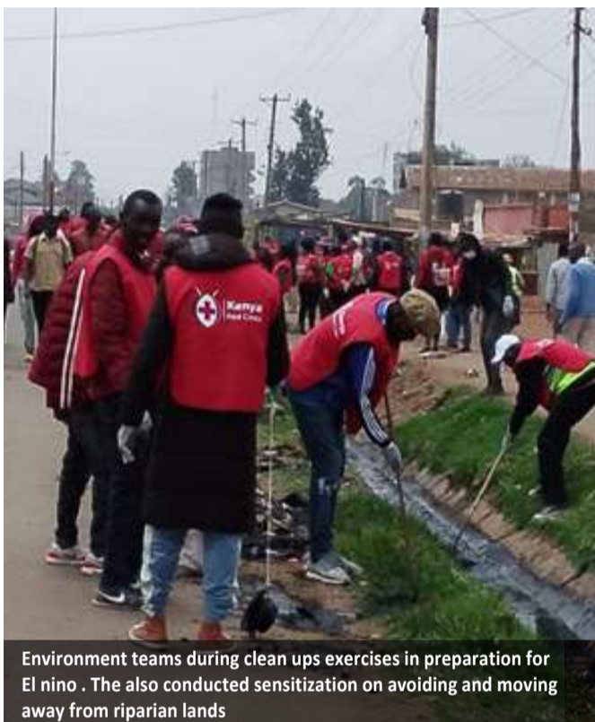
Environment teams during clean ups exercises in preparation for El nino . The also conducted sensitization on avoiding and moving away from riparian lands