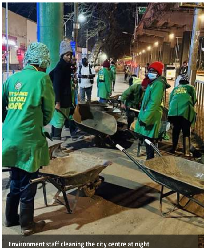
Environment staff cleaning the city centre at night