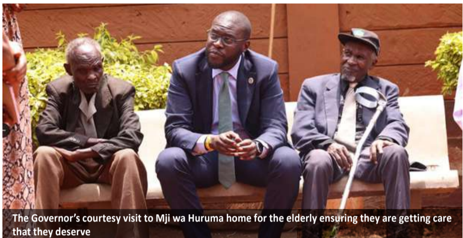
The Governor's courtesy visit to Mji wa Huruma home for the elderly ensuring they are getting care that they deserve