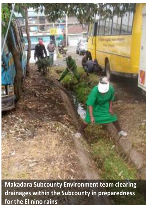
Makadara Subcounty Environment team clearing drainages within the Subcounty in preparedness for the El nino rains