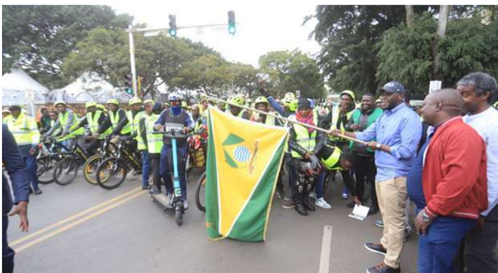
Flagging off electric motor bikes