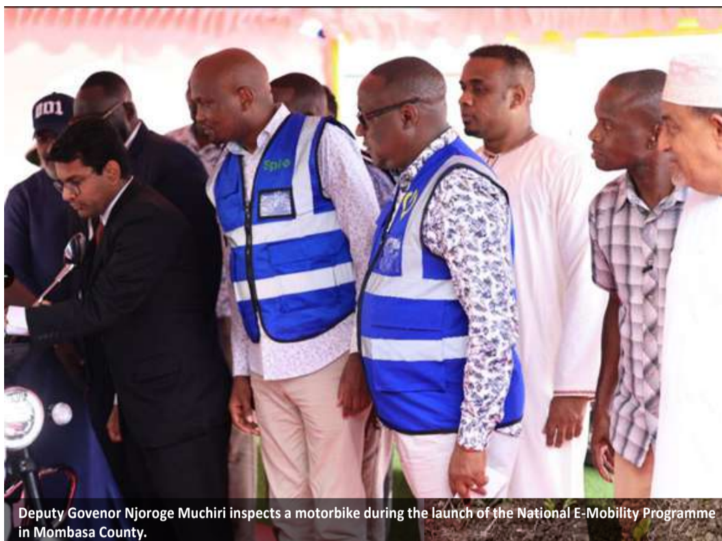
Deputy Governor Njoroge Muchiri inspects a motorbike during the launch of the National E-Mobility Programme in Mombasa County.