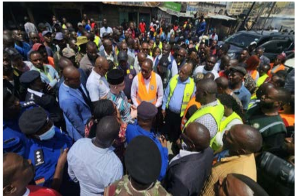
H.E Muchiri, joins other government officials visiting Mradi Estate in Embakasi East gas explosion site