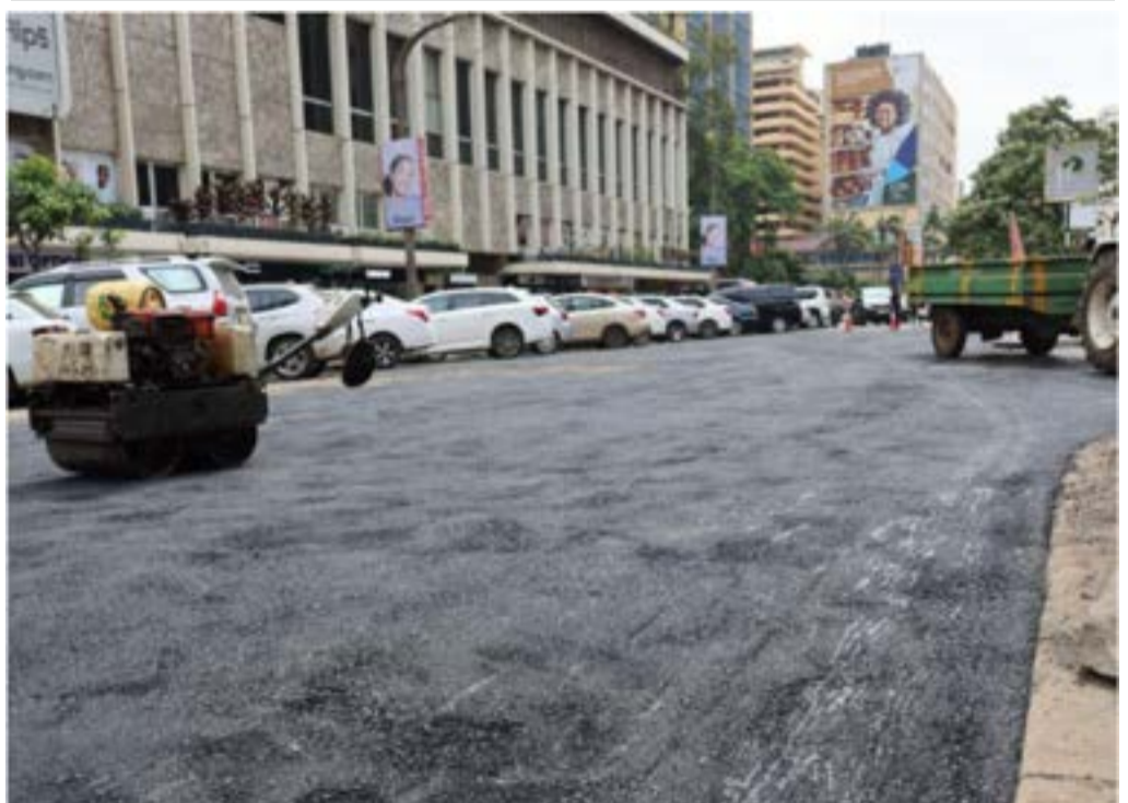
Ongoing road works on Mama Ngina/Kimathi Street junction

A publication by the Nairobi City County Government