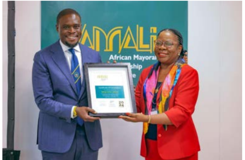
H.E Sakaja receives a certificate of completion after attending the Amali leadership Forum in Cape town