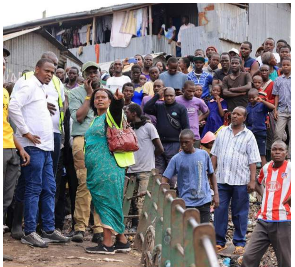
Governor Sakaja visits Mukuru kwa Reuben to assess damages caused by the floods

A publication by the Nairobi City County Government