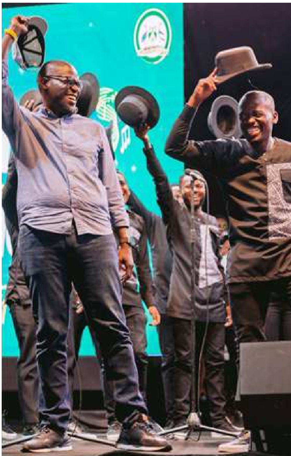
Governor Sakaja at 2 ND Edition of the Nairobi's Battle of Choirs Easter Festival