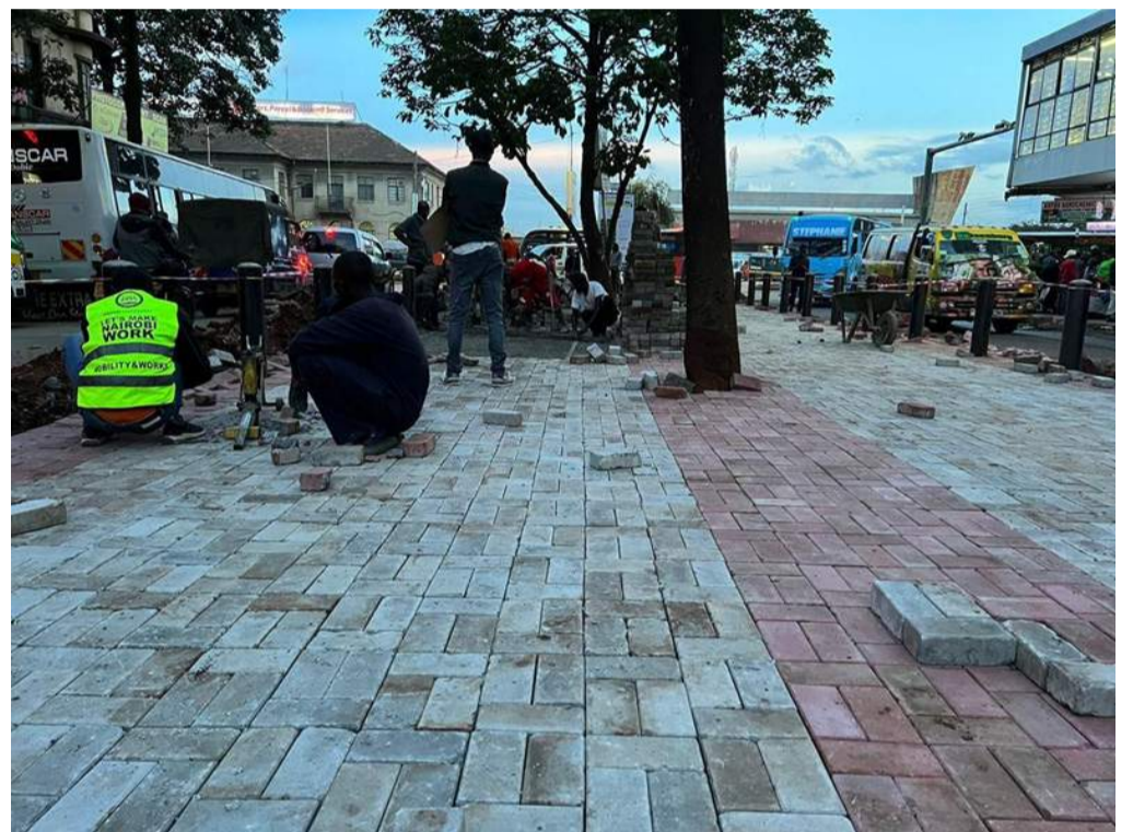
Construction of Walkways and beautification on Tom Mboya Street, CBD