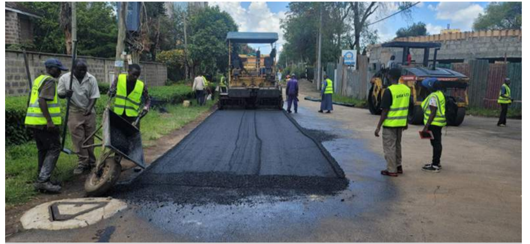
Road works on Suguta Road in Kileleshwa Ward