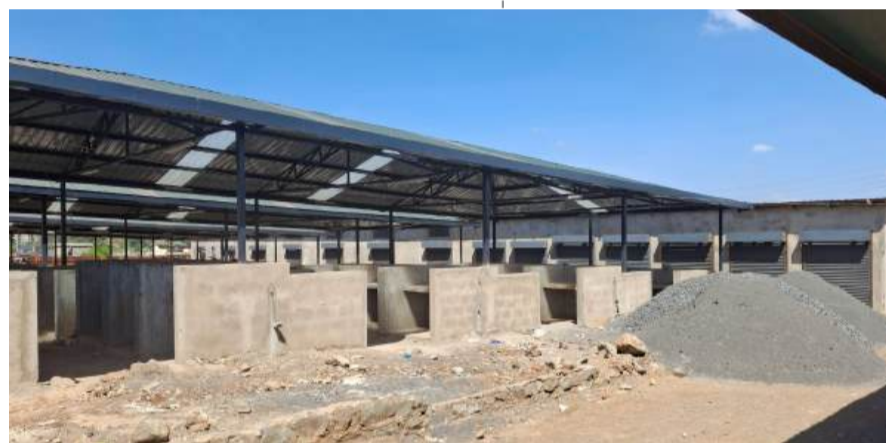
The ongoing construction of Mutuini modern market in Dagoretti South Sub county