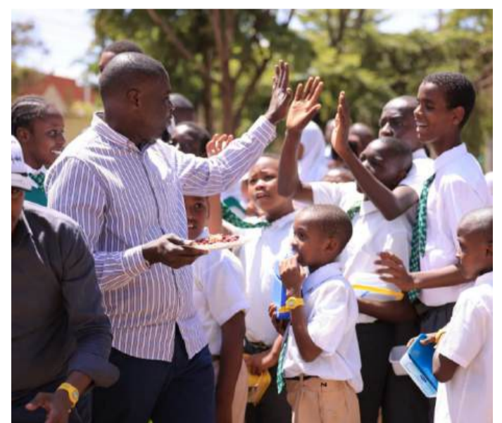
Children of Westlands Primary share a light moment with Governor Sakaja during the lunch break

A publication by the Nairobi City County Government