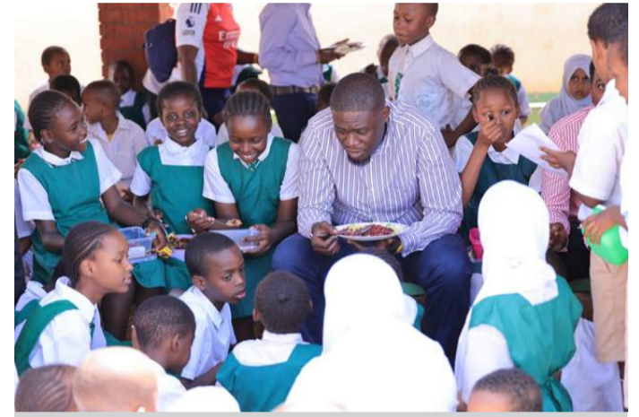
Governor Sakaja shares a meal with learners at Westlands Primary his alma mater in Westlands sub-county