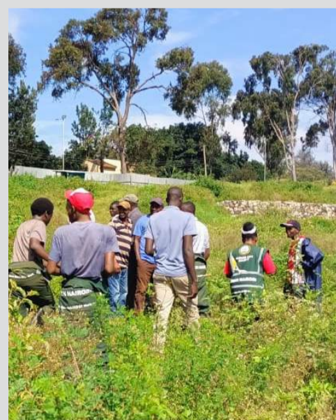
Team of multi-sectoral experts doing a geotechnical survey of the project (CAIP)